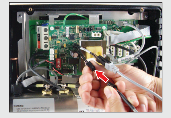
- Insert the Balboa Wi-Fi Cable into the first end of the Y-Cable (25657) Panel Jack.

Insert your Control Panel into the second end of the Y-Cable Panel Jack.