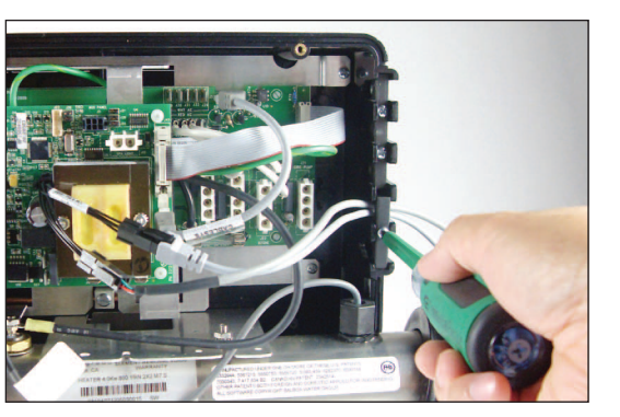
Insert the plastic holder and screw back in place. Make sure the 2 cable wires are secure in place.