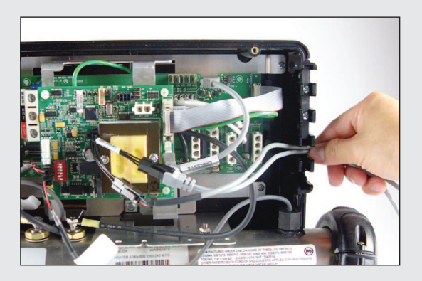
Place the Wi-Fi cable and Control Panel cable inside the wire holder.