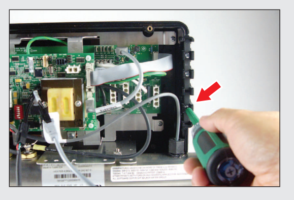
- Remove 1 screw to open the cable holder.